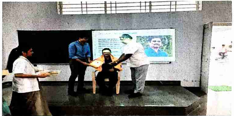
Head of the Dept